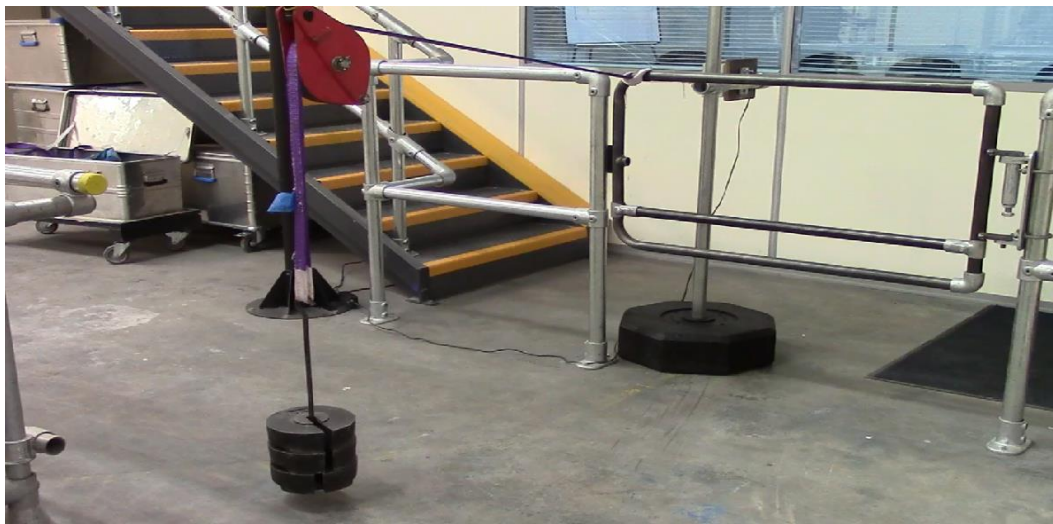
14122-3 30kg load @ Point A