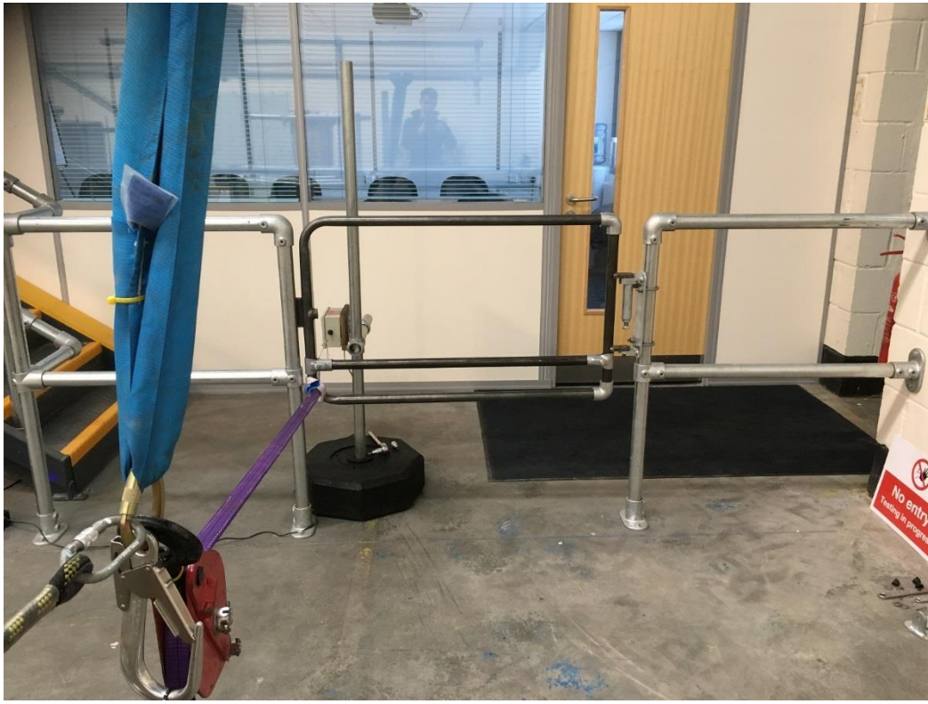
14122-3 30kg load @ Point C